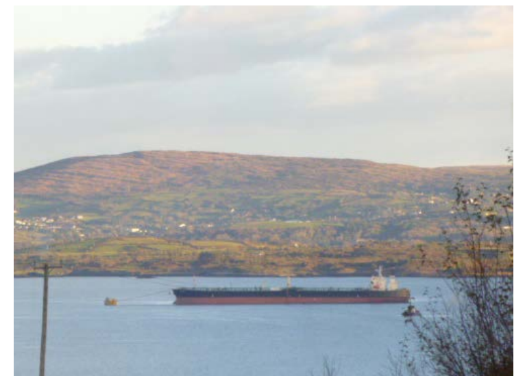
Figure31: A Vessel at Bantry Bay