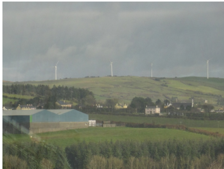
Figure 33: A good example of mixed land uses including agriculture, forestry, energy, and residential. These all give new layers to the landscape and have various impacts.

Bantry Bay demonstrates the limitations of planning legislation (which stops at the water's edge), and reminds us that conflicting policies of multiple governmental departments (for example the marine), which can be centralised and seem non-transparent, can meet in local areas such as Bantry Bay. The main point is that the planner has to delicately balance competing interests of stakeholders, build consensus and deliver a plan to resolve conflict, and it is a good idea to start this process by returning to first principles.