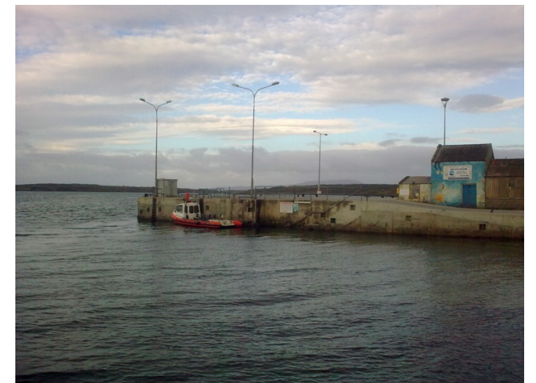
Figure 4: The Importance of Fishing at Baltimore Harbour

To be rural, live in a rural place and follow a rural way of life