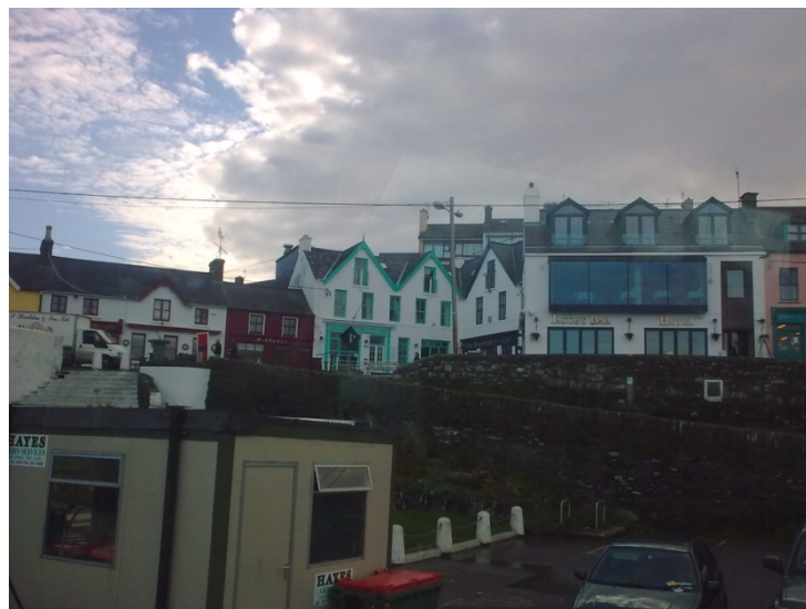
Figure 16: A Contemporary Baltimore