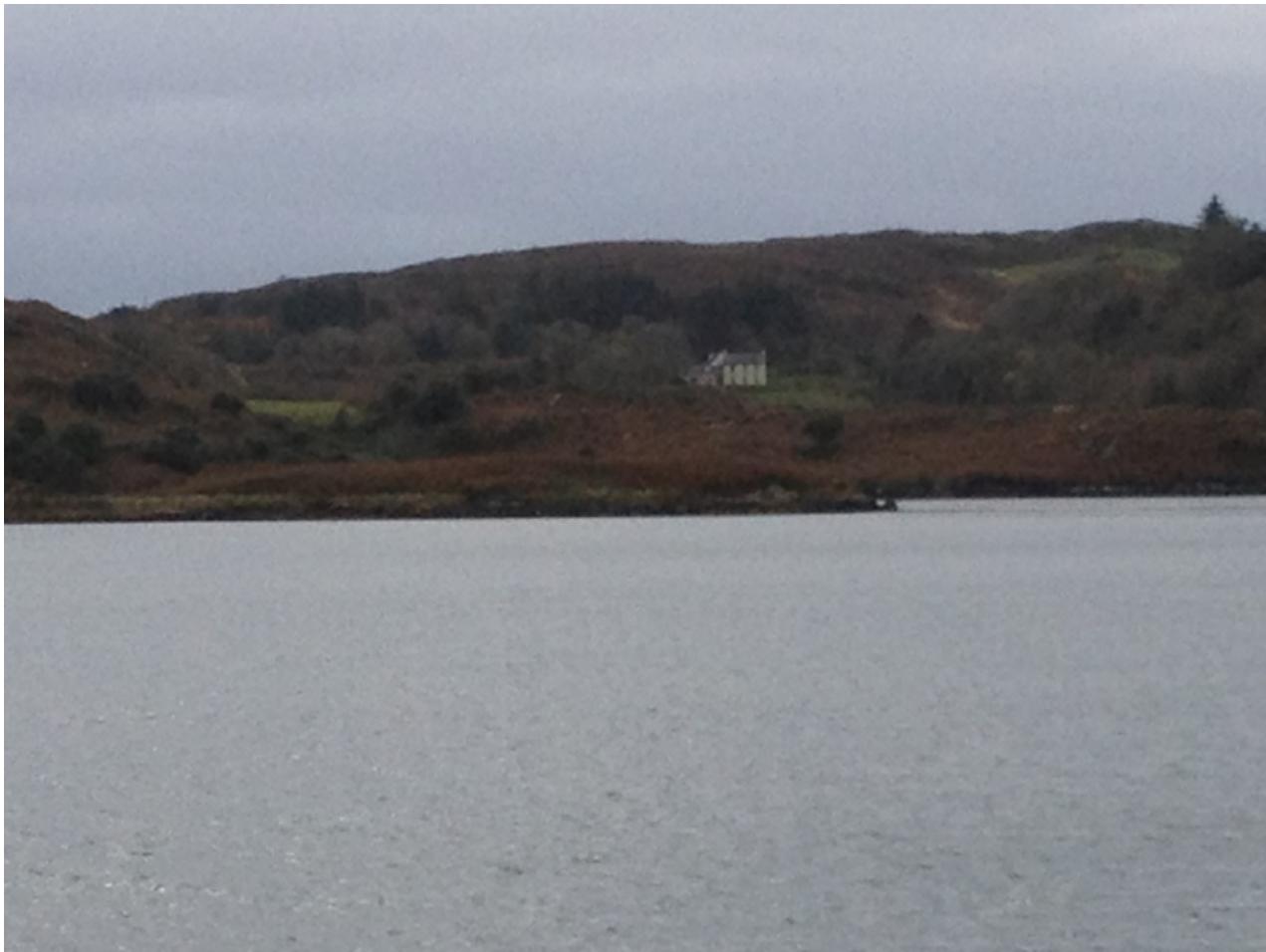
Figure 13: A distant View Showing the Scarcity of Homes at Lough Hyne

On our visit to Lough Hyne it became apparent that European Directives have impacted the landscape of West Cork. Lough Hyne is heavily controlled and its level of protection is second to none. The natural beauty of this place is unquestionable and it is no surprise that visitors and tourists are attracted to the area. This is an example of good planning, and the evidence is not in what has been built or developed here, rather it is the way development has been prohibited to keep this place successful. While the area is somewhat away from more utilised circulation routes, there is activity here. The recreation and leisure value of this amenity stands out at a first glance, and the evidence is a slipway for boats, a hot-blooded swimmer, walkers, and kayaks. The ecological value is more significant, and this was seen with the presence of birds, plants and notice boards indicating that so much more is happening in the water. Also the interpretative centre is off site in nearby Skibbereen town. The planner has to delicately balance competing interests for this area and it is probable that the demand to build homes to take advantage of the setting is an on-going call that has to be refused with a presumption against development that will impact the area's unique environment.