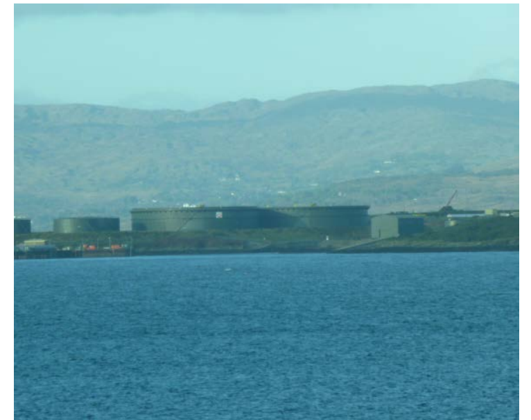
Figure 29: Whiddy Island