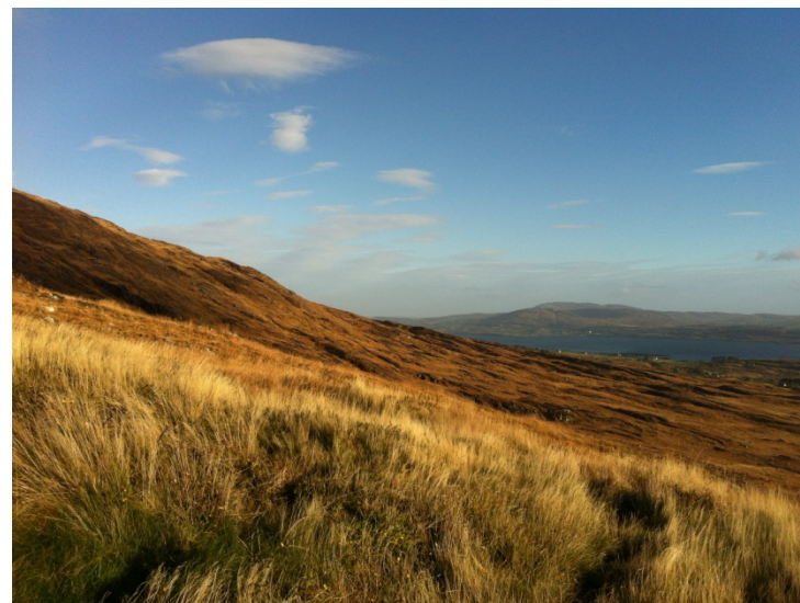
Figure 3: A Harsh Landscape