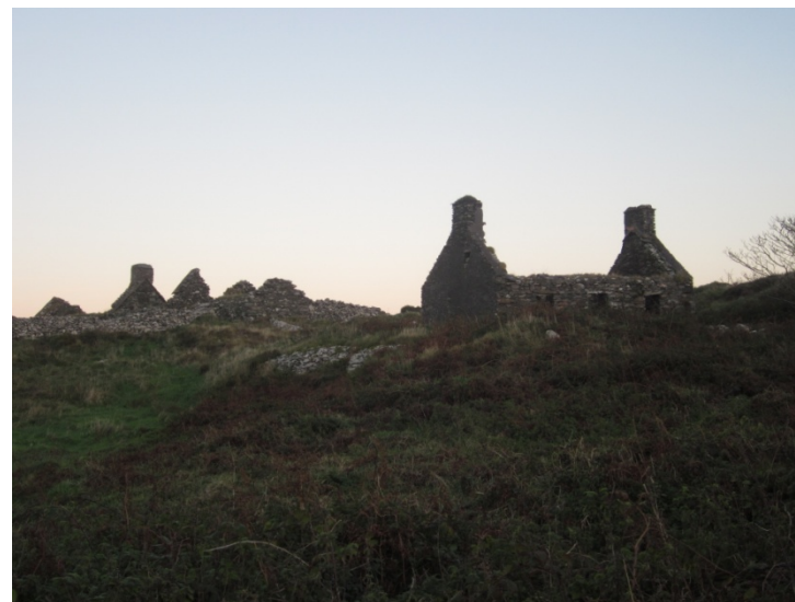
Figure 17: The Remains of a Community