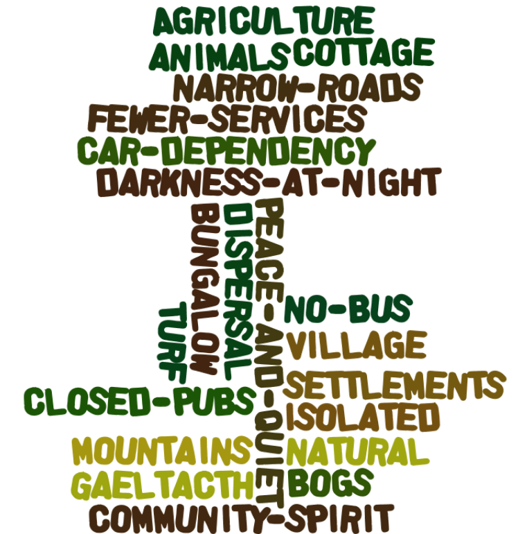
Figure 1: A brainstorming session at the beginning of the rural module, aimed at presenting our perceptions of rural Ireland

How do you illustrate what rural is? What is the quintessential symbol of rural Ireland (or West Cork)?