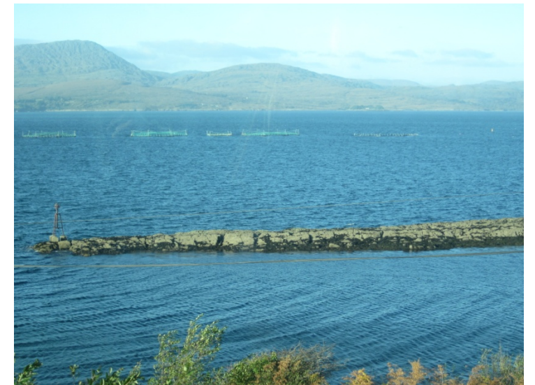
Figure30: Fishing Pods Float on the Water