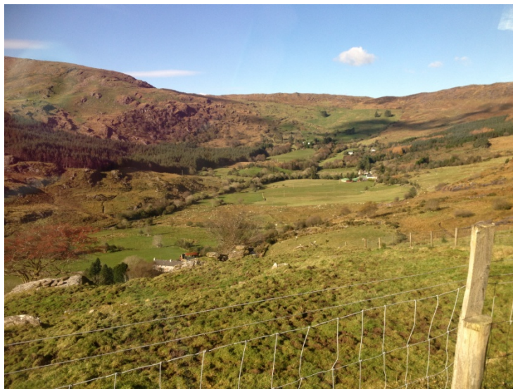
Figure 8: The Bolvin Valley