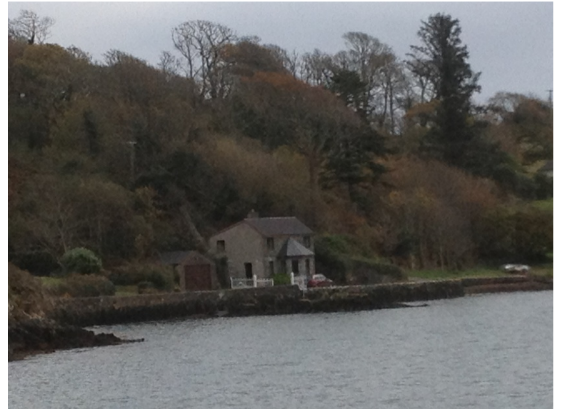
Figure 11: One of the Few Houses of Lough Hyne