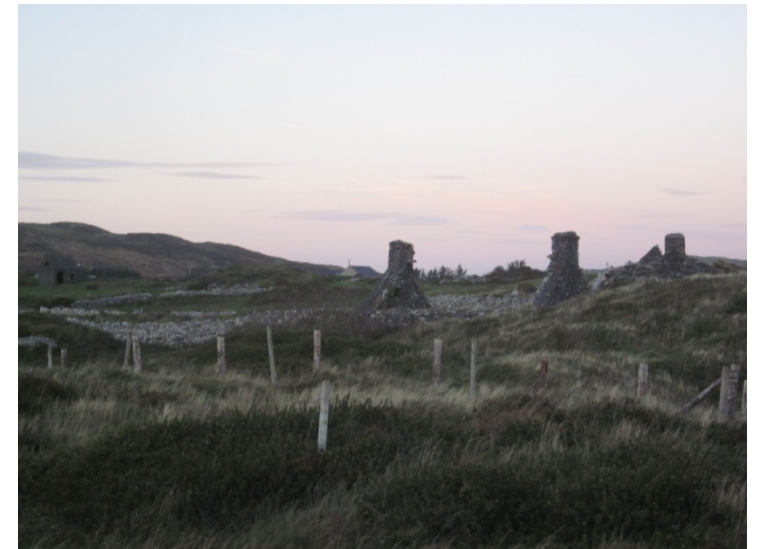
Figure 14: A Link to the Past

The sea is perhaps the community base too; not only is it the venue for the activities already mentioned, but it is also a rallying point when the lifeboat is deployed. What is striking here is the comparison with the city, and I wonder what it is that drives people to risk their lives for those of their community. If there was a fire in the city you would call the fire brigade, but you would not expect a response from a voluntary organisation, and this is special quality that is unique to the maritime community.