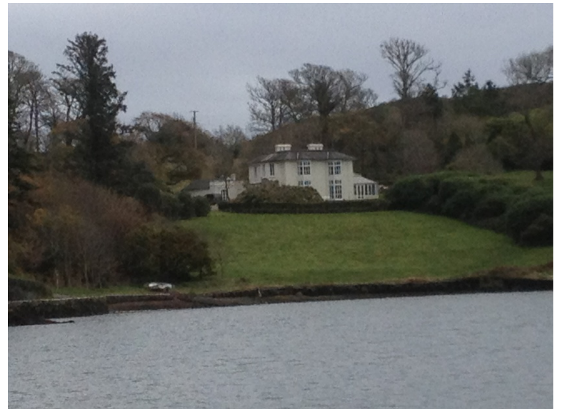
Figure 12: An Earlier Example of a House at Lough Hyne