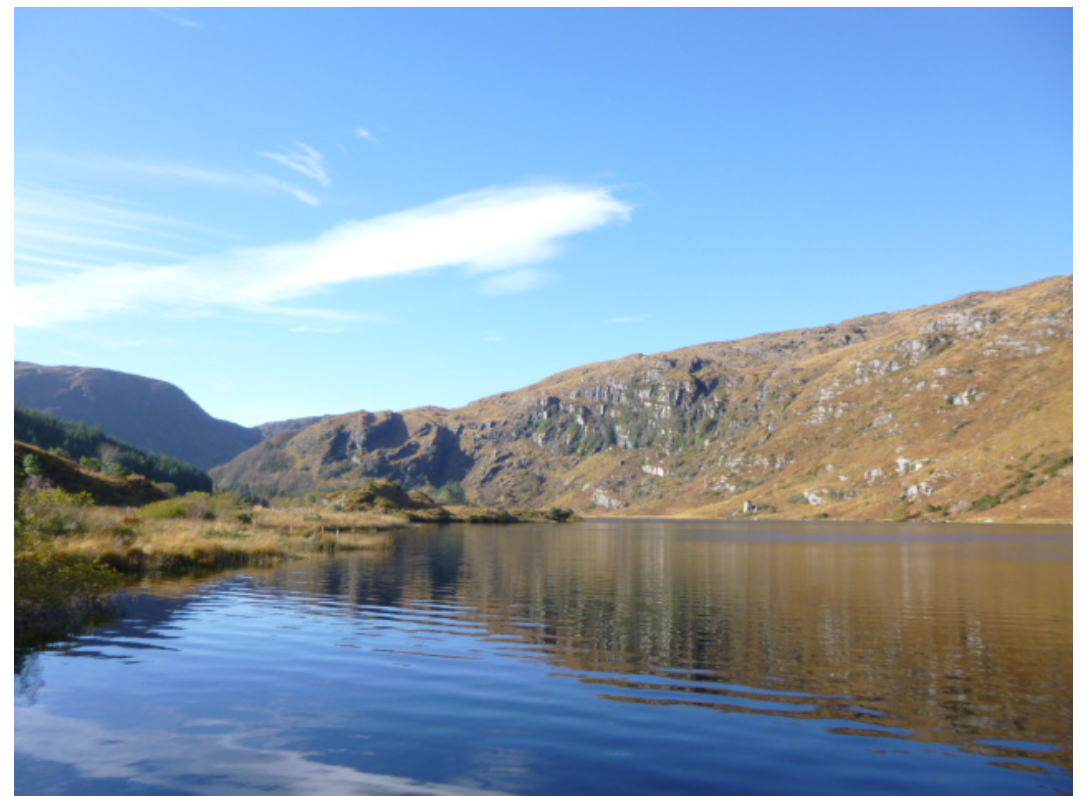
Figure 38: Another View of Tranquillity