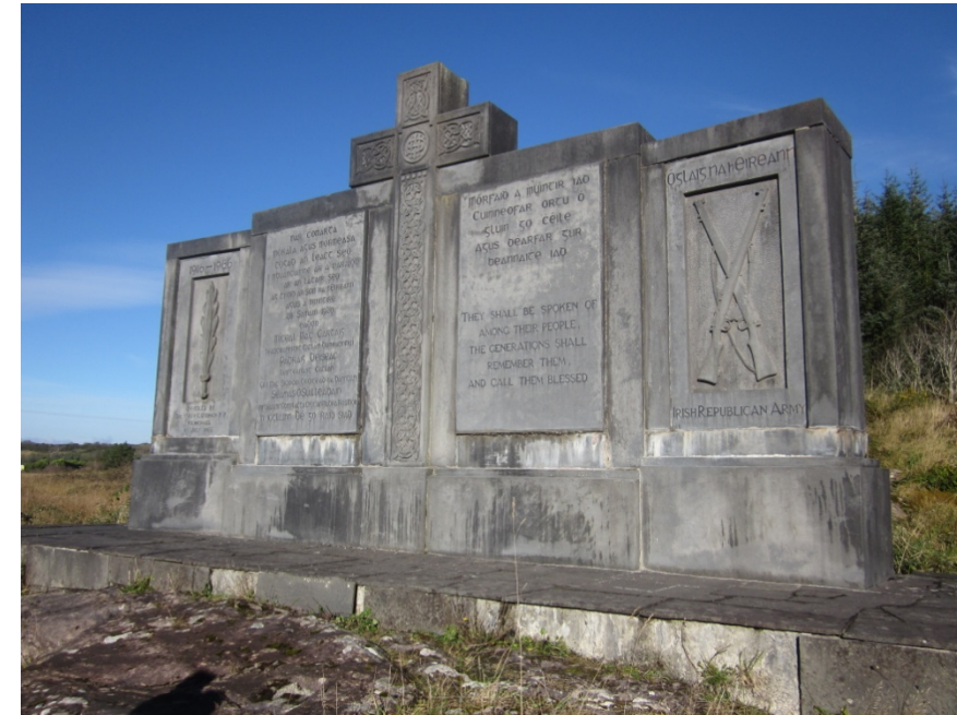
Figure 6: The significance of place is evident at Kilmichael, where the IRA ambushed the British Army