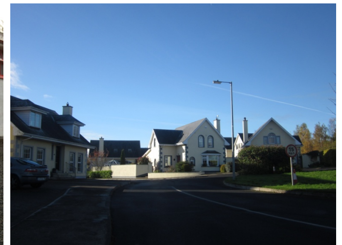
Figure 23: Introducing Suburbia