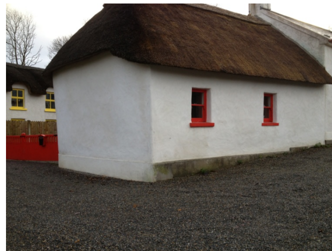
Figure 22: Irish Thatch at Licketstown