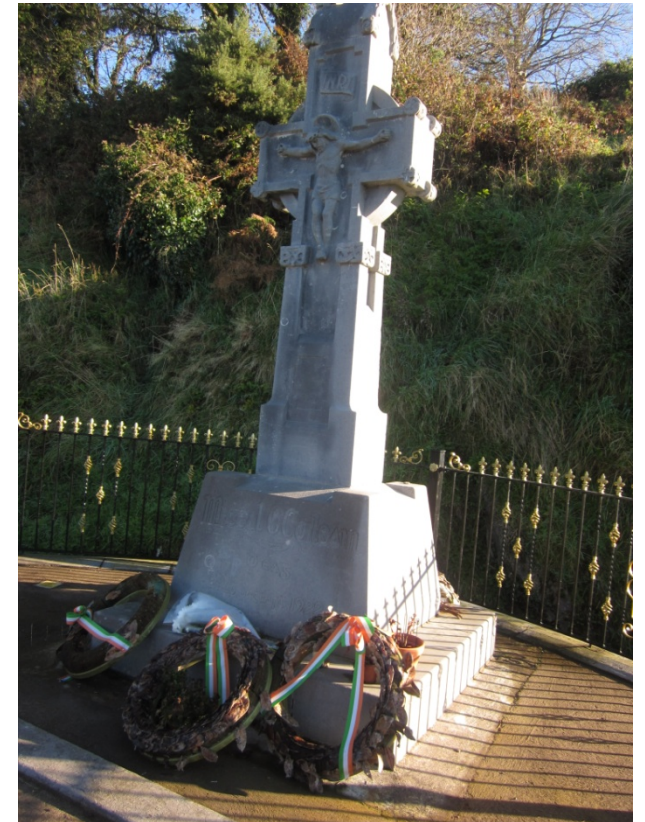
Figure 7: Beal na Blath

What made Inchigeelagh and Ballingearry different? Did the water and wind have an Irish accent or is the Gaeltacht an imagined and socially constructed concept? It is certain that policy and intervention can positively discriminate in favour of our language, by drawing a virtual line of protection around it, but this was not obvious from the landscape.