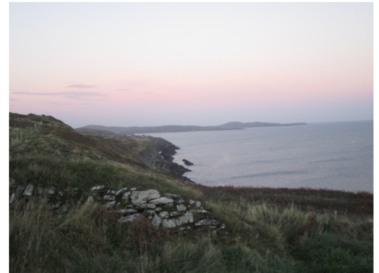
Figure 15: Cork's "Spain"