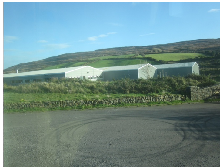
Figure 32: Fish Processing Plant