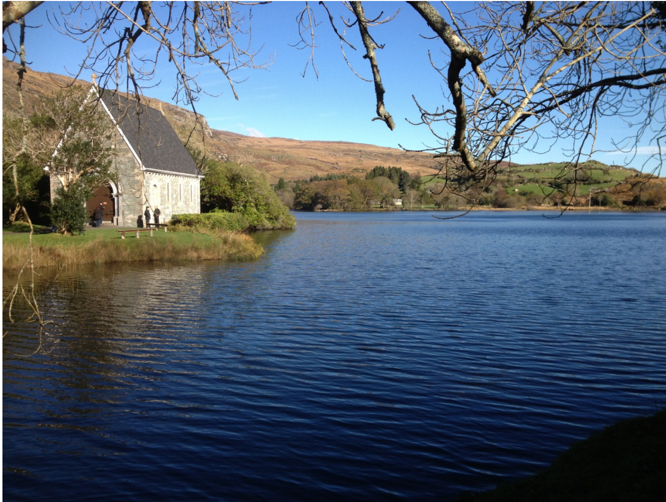
Figure 36: Gougane Barra Lake