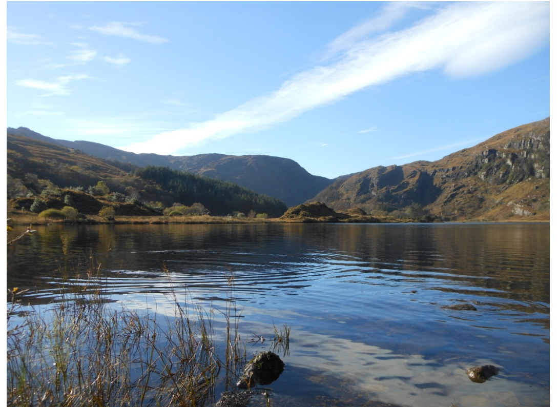
Figure 37: Naturalistic Isolation

The landscape has a jagged appearance of layered red sandstone rock and strips of green vegetation. This gives the landscape an ecological value (plants and nesting sites). Flora includes gorse, broadleaf trees and shrubs and there is rush and willow nearer to the water's edge.