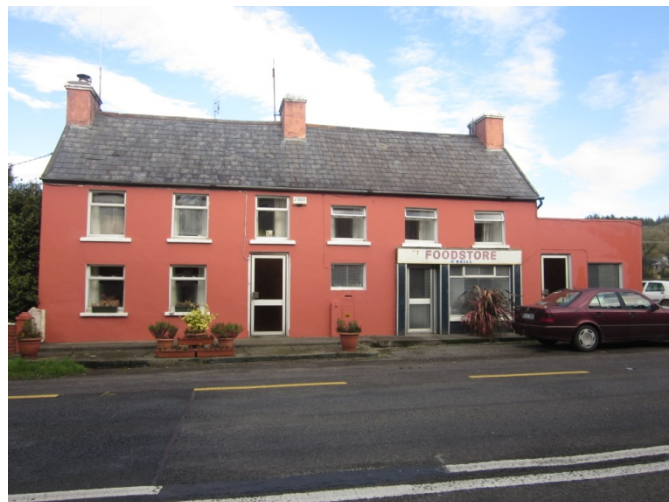
Figure 19: Churchcross

While it was relatively easy to spot development that we agreed was inappropriate, it was more difficult to agree on a development typology that ought to have been built. A trip to Licketstown gave us an insight into the past and a visual reminder of the Irish vernacular. The clustering of agricultural workers' farm houses and outbuildings reminded us the past can provide guidance for the future and not all of rural Ireland is on a national primary route.